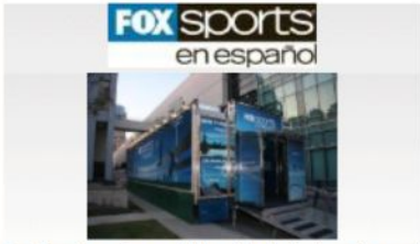
Fox Sports en Español takes the Upfront on the road. View Multimedia Gallery

Press Release Source: Fox Sports en Español On Wednesday May 19, 2010, 1:46 pm EDT